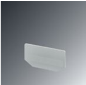
End cover, length: 68 mm, width: 2.2 mm, height: 34 mm, color: gray

Please be informed that the data shown in this PDF Document is generated from our Online Catalog. Please find the complete data in the user's documentation. Our General Terms of Use for Downloads are valid ( http://phoenixcontact.com/download )